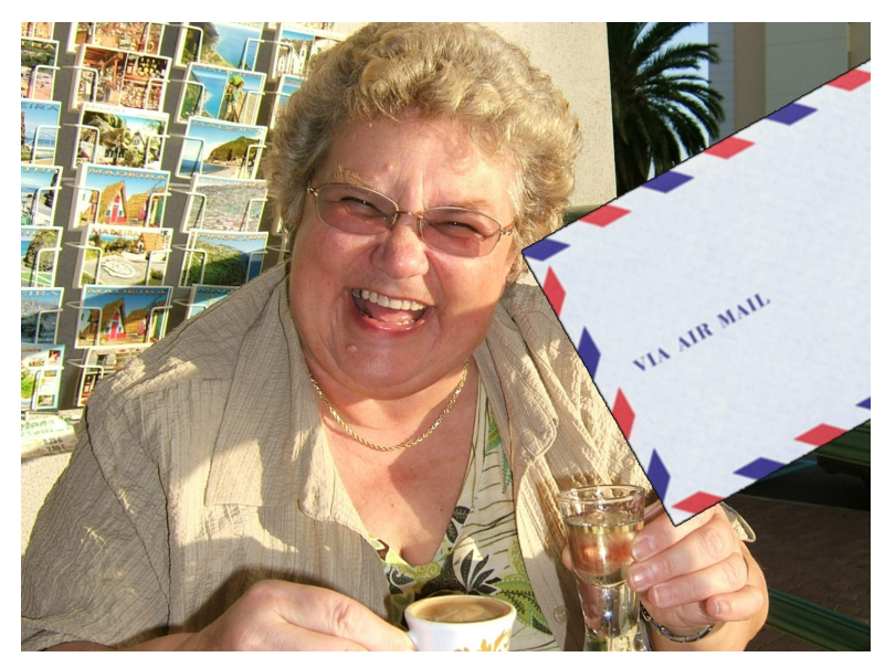
Putting life into my years in Florida!